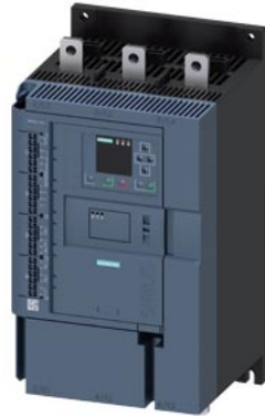
SIRIUS soft starter 200-480 V 470 A, 110-250 V AC spring-type terminals