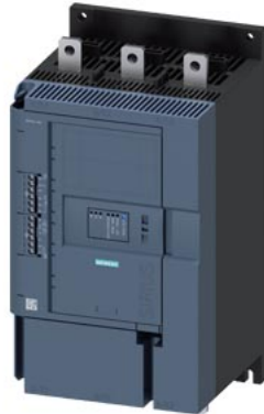
SIRIUS soft starter 200-480 V 210 A, 110-250 V AC Screw terminals Analog output